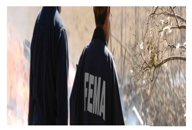
FEMA Careers.

Anna Maria College Online Programing article "Origins of U.S. Emergency Management" (2014), the newly created FEMA accomplished the following: