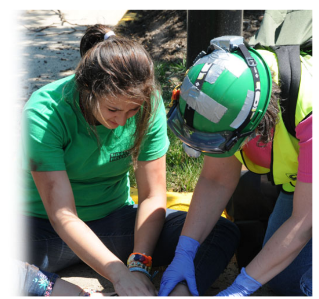
CERT training.

College campuses are complex communities and have differing vulnerabilities, or potential disasters, that could affect them based on their geographic locale and the environment of the surrounding area. Due to the varying difficulties and needs of campuses across the nation, it is reasonable to state that a single, one model-fits-all approach to C-CERTs would not be appropriate to the dynamic of properly preparing college campuses for disasters. The official annex to the basic CERT training guide for C-CERTs provides for the necessary flexibility by allowing schools to add training requirements or make adjustments as needed (Katims, 2013).