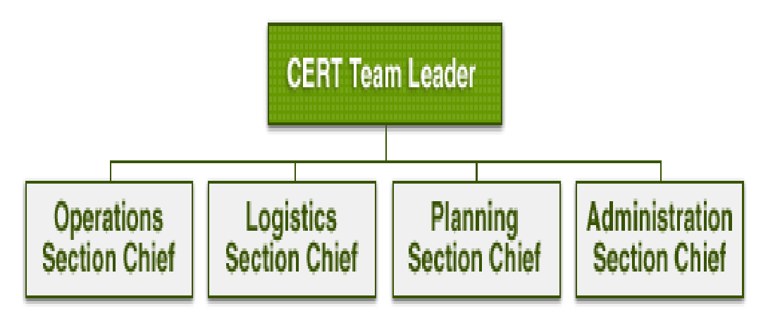
CERT/ICS Command function.