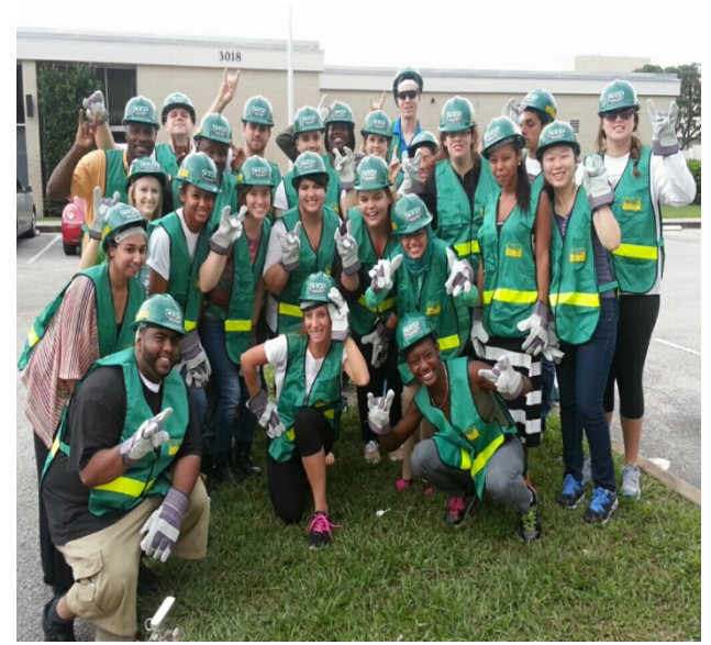
CERT training.

C-CERTs and the role they provide their community in the context of disaster preparedness and resilience.