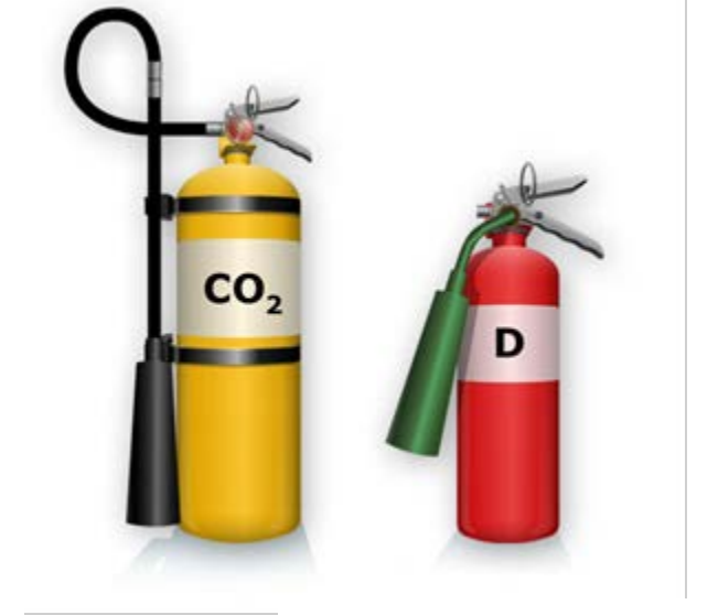
CERT Training.