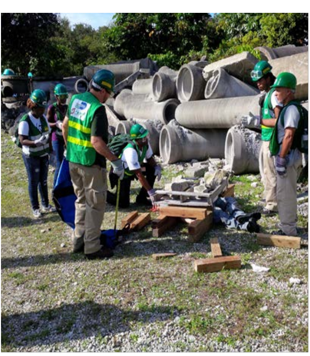
CERT Training.

CERT members are local volunteers who are trained in disaster preparedness and response for events/issues their local community faces. FEMA has outlined universal training guidelines for the CERT program, but how communities deliver that program, and how they mobilize and utilize their volunteers, is up to the discretion of CERT team leaders and local authorities/ professional responders. The CERT course is delivered in the community by someone who is qualified, usually first responders, and the instructor has completed a CERT Train-the-Trainer (TTT) course. The Trainthe-Trainer course is usually conducted by the State Training Office of Emergency Management or the Emergency Management Institute ("About Community Emergency Response Team," n.d.).